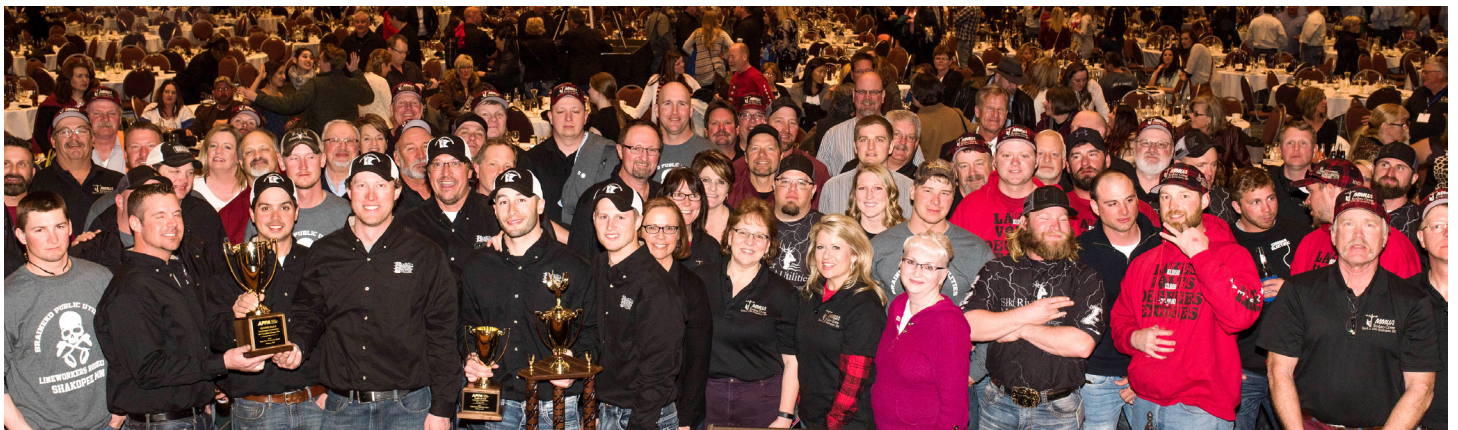
The Minnesota group at the 2016 Rodeo banquet in Minneapolis.